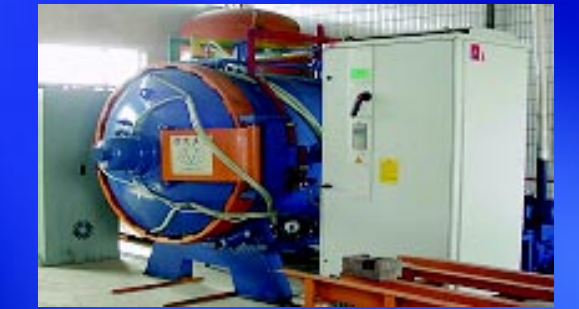
Vacuum Heat Treatment