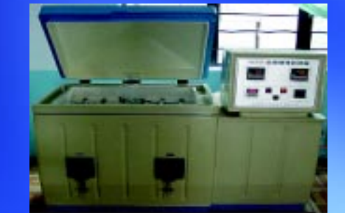
Salt Spray Test