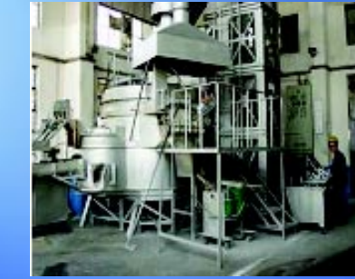
Die Casting Shop